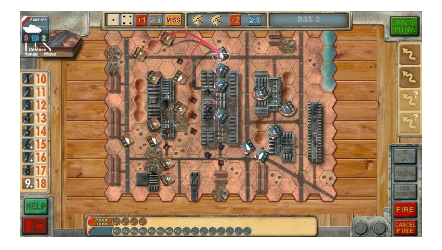
Tank On Tank Digital - East Front Activation Crack

Download ->>->> <a href="http://bit.ly/2NHbQRM">http://bit.ly/2NHbQRM</a>